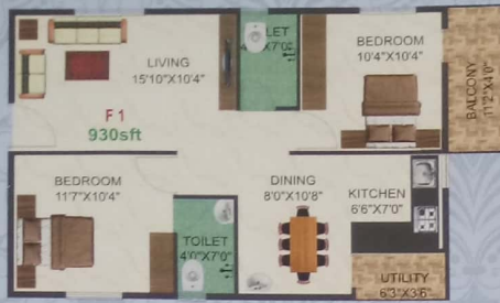
2 BHK Area : 930 sft Flat No. F1