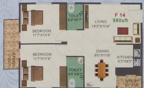
2 BHK Area : 980 sft