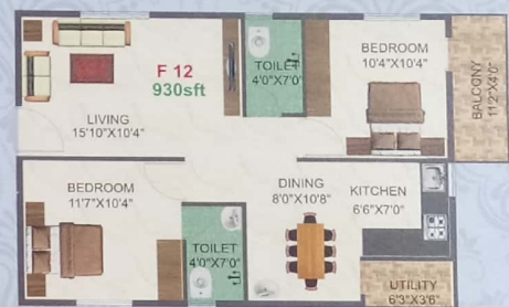
2 BHK Area : 930 sft Flat No. F12