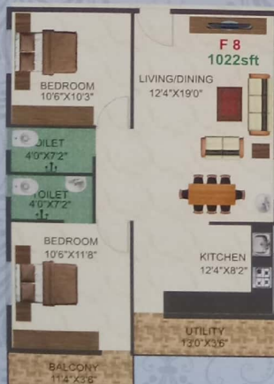
2 BHK Area : 1022 sft Flat No. F8