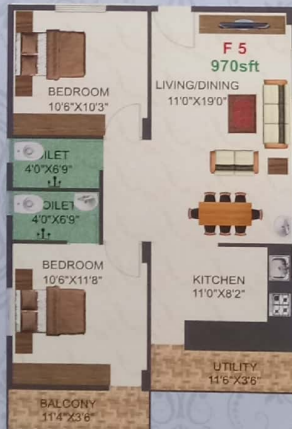
2 BHK Area : 970 sft Flat No. F5