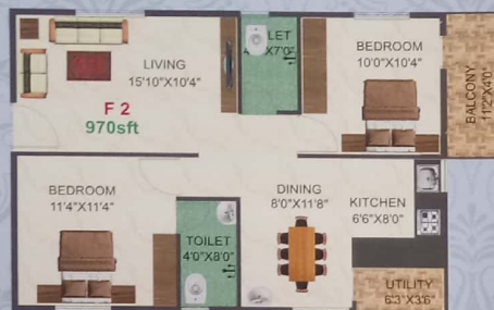
2 BHK Area : 970 sft Flat No. F2