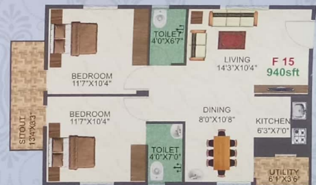
2 BHK Area : 940 sft Flat No. F15